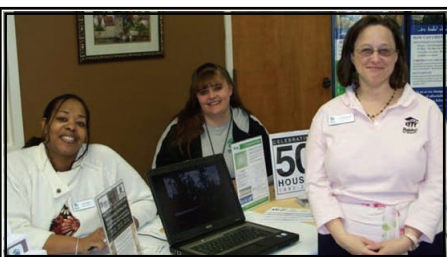
Representatives from Habitat for Humanity

The Asset-Building Coalition of Kitsap is hosting an informational workshop to be held at Kitsap Community Resources this Saturday, Dec. 5. Open to the public, participants will learn about exciting home ownership opportunities available for low-income individuals, including down-payment assistance programs and tax breaks for low-income wage earners. Free credit reports and credit counseling will also be available, in addition to free food and door prizes.